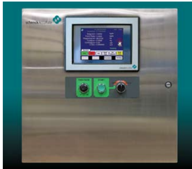
(OP1 shown with non-mechatronic controller)

For more information, please contact us at 1-800-558-0184 or Fax: 262-473-4384 E-mail: mktg@accuratefeeders.com Web site: www.accuratefeeders.com